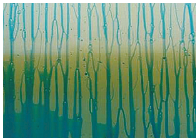
Untreated high-modulus fabric: nonuniform wetting